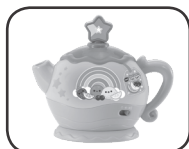
One Sip and Learn™ teapot