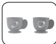
2 tea cups